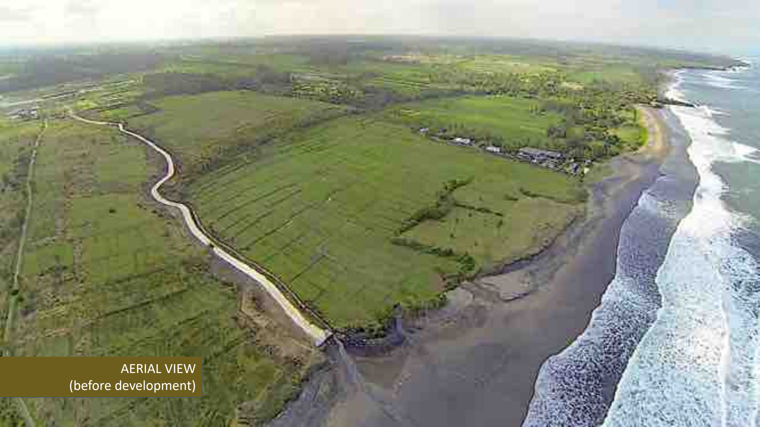
AERIAL VIEW (before development)