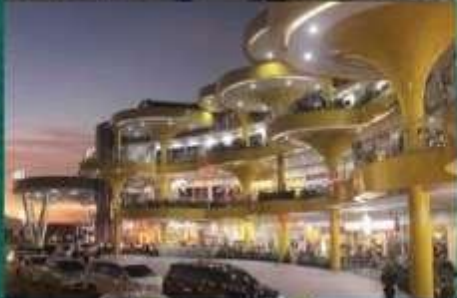
Cibinong City Mall 5 Menit