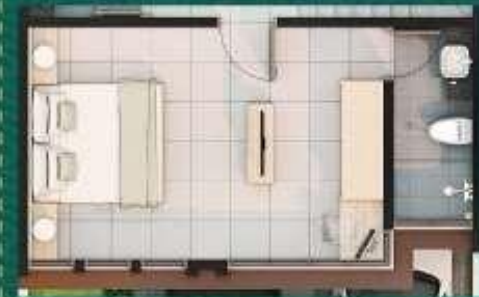
Lt. 2 Diamond Deluxe