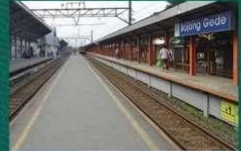
Stasiun Citayam & Bojong Gede 15 Menit