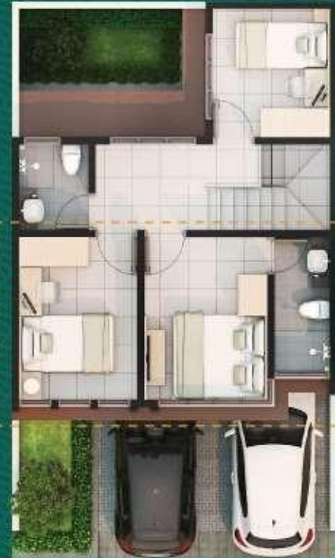
Lt. 2 Diamond Standard