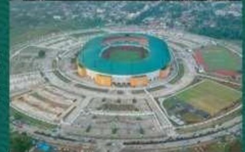
Stadion Pakansari 15 Menit