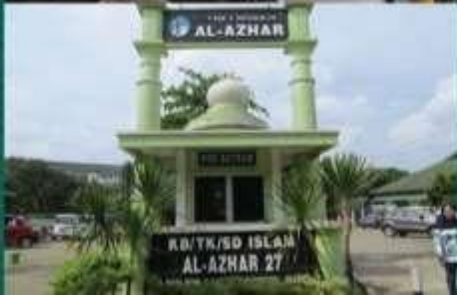
Al Azhar Islamic School 32 Menit