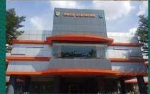
RSUD Cibinong 10 Menit