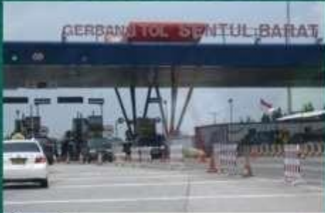
Sentul & Citereup Toll Gate 15 Menit