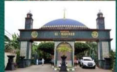
Kampus Almadinah Cibinong 15 Menit