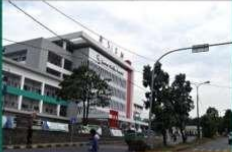
Sentra Medika Hospital 15 Menit