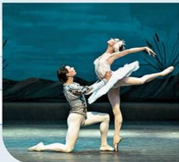
ART GALLERY AND THEATER