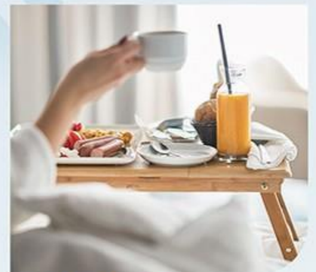
FIVE STAR HOTELS