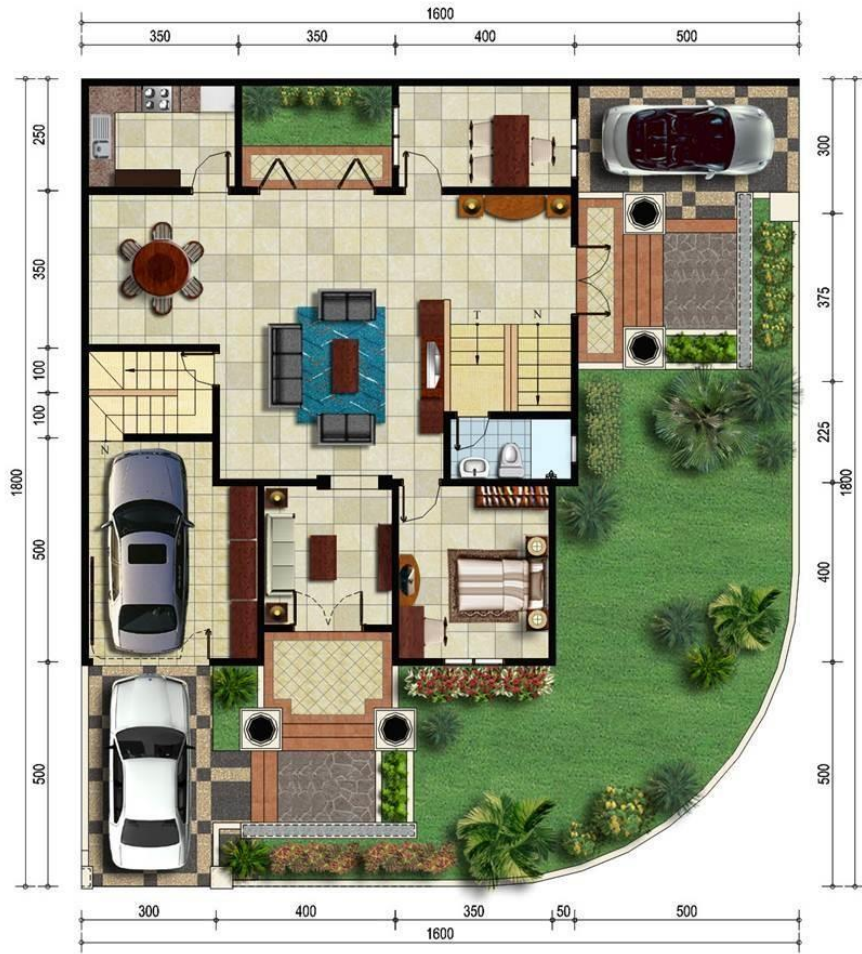
DENAH LT. DASAR