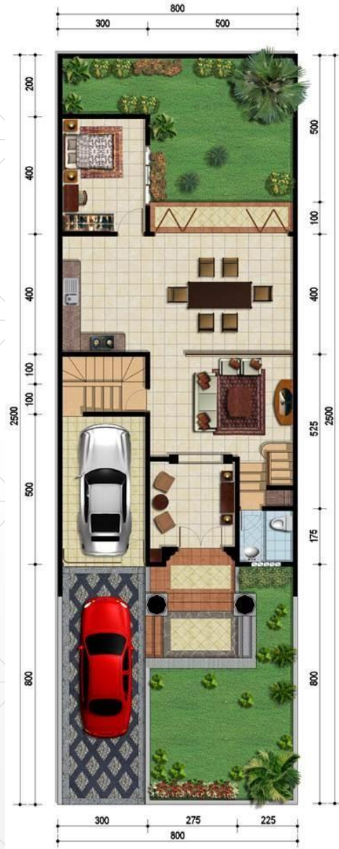
DENAH LT. DASAR