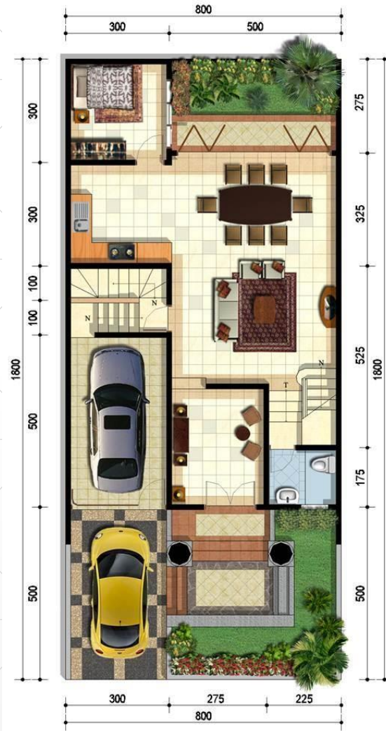
DENAH LT. DASAR