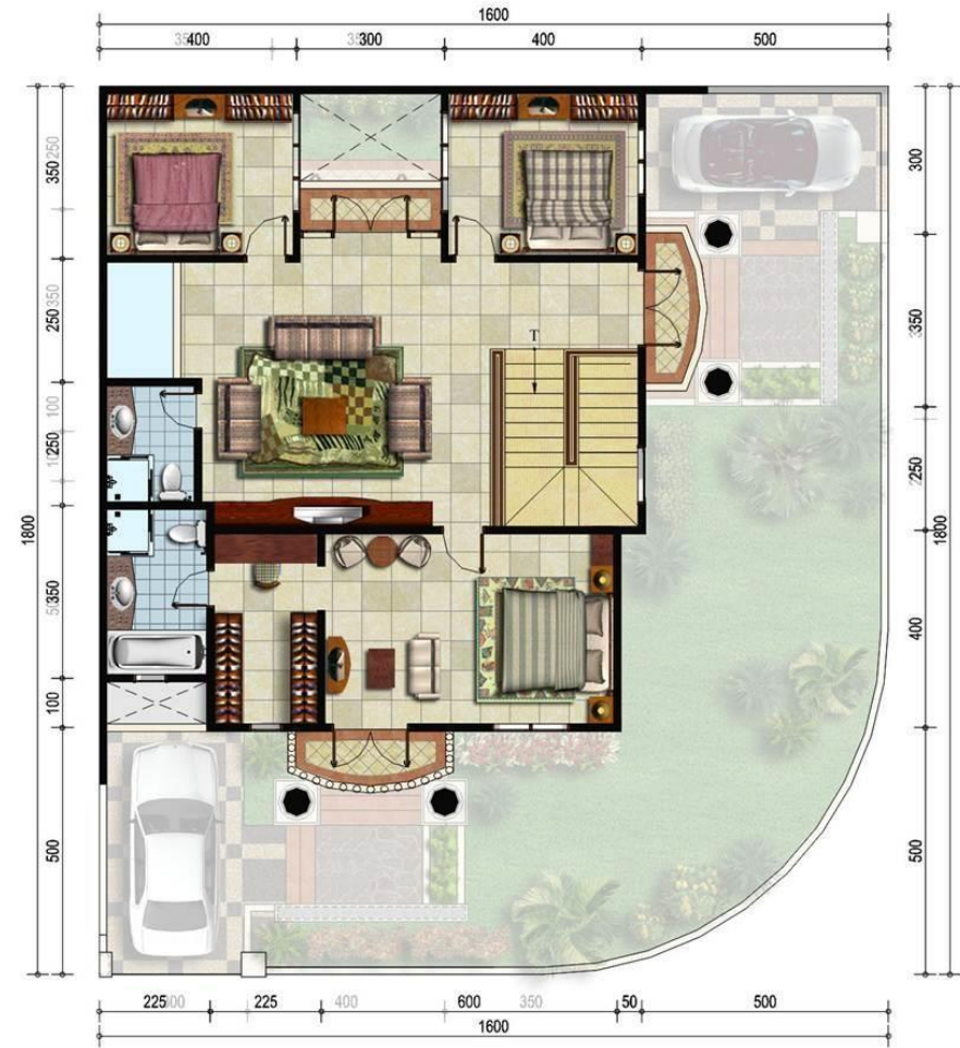
DENAH LT. ATAS