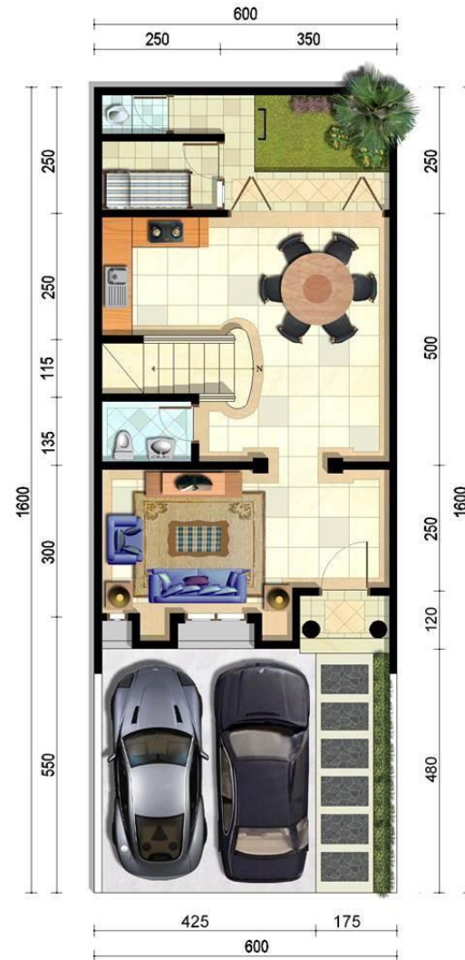
DENAH LT. DASAR