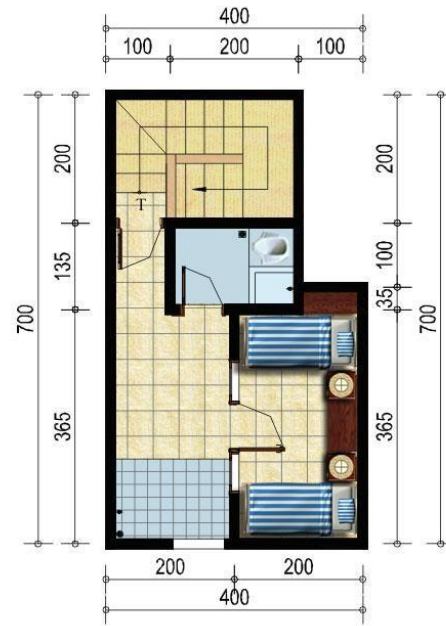
DENAH LT. MEZANINE