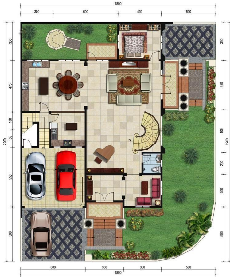
DENAH LT. DASAR