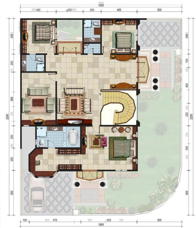
DENAH LT. ATAS