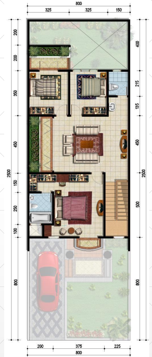
DENAH LT. ATAS