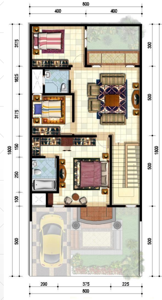
DENAH LT. ATAS