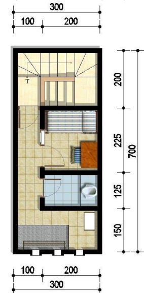
DENAH LT. MEZANINE