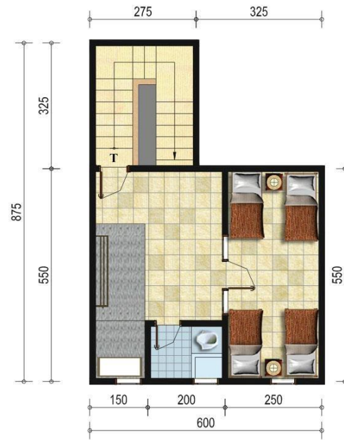
DENAH LT. MEZANINE